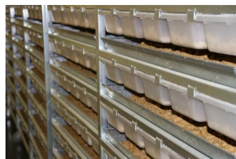
Rodent rack system with tubs and chow trays.

Rodent enclosures are cleaned regularly depending on the density of rodents, extent of waste product accumulation, and age of recent offspring. Solid waste and substrate are disposed of in an appropriate container, and the tubs are washed in detergent to remove remaining particulates. A common practice is to soak tubs in a 10% bleach solution followed by rinsing; optionally tubs are sprayed with additional disinfectant and allowed to dry before re-use.