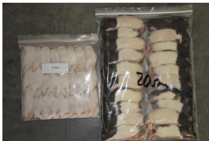
Frozen mice and rats, labeled and packaged for shipping.

Rodent offspring are removed for sale at various stages of life to accommodate the variety of reptiles being fed. Terminology and descriptions differ somewhat among producers, but the table below describes the general classes of feeder mice and rats. Feeder rodents are sold live or frozen; the majority of animals are frozen which simplifies transportation and avoids degradation in quality of live animals from transport stress. Neonates typically are frozen directly per standards of the American Veterinary Medical Association, while larger rodents are euthanized before freezing (AVMA 2013). Frozen rodents are bagged and shipped in quantity according to the size of the order. Live mice and rats are shipped in well ventilated, leak-proof containers with absorbent bedding. Water and food are provided for animals in transit for more than six hours.