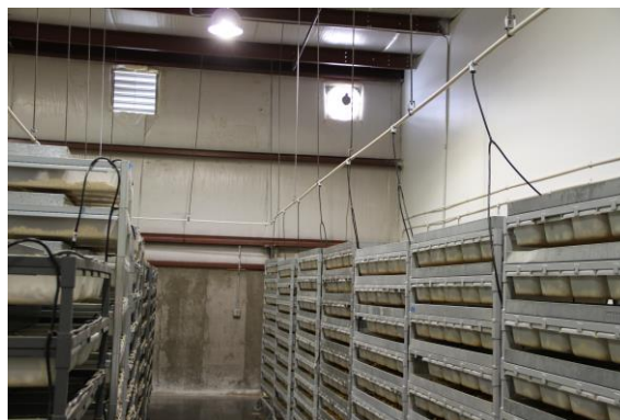
A well-managed feeder rodent facility will be clean, but not sterile.

By contrast, most feeder rodents typically are sold before or shortly after weaning, and the presence of infectious agents at subclinical levels is not a concern. Commercial breeder animals are maintained for their effective reproductive lives and typically are resistant to common pathogens. Most disease management approaches employed at research facilities are inappropriate for commercial feeder operations. Put simply, a well-managed rodent production facility will be clean but not sterile. Therefore the best management practices for feeder rodent facilities recommended in this document focus on observing gross symptoms of infectious agents rather than detecting the presence of potential pathogens in the absence of clinical signs of disease. As with research rodents, the longer life span of pet rodents suggests standards for caging and veterinary care that are unnecessary for feeder rodents.